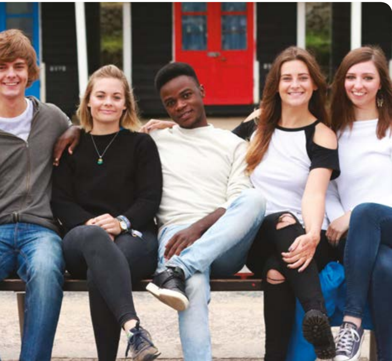
SUBU Sabbatical Officers