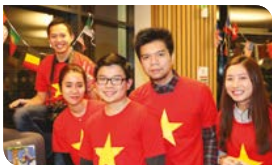
One world day