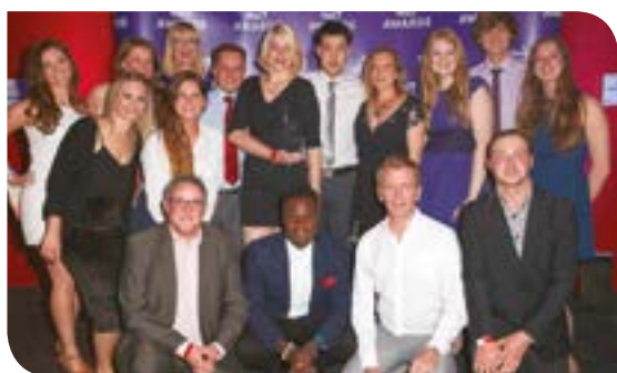
NUS awards education winners 2016